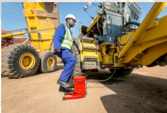
Using The G.Gun - Easy, Super Fast and Effective.